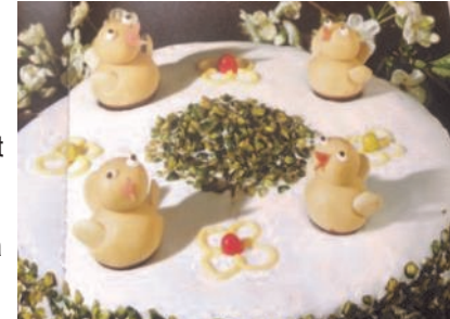
"Many traditional Easter cakes and desserts include eggs..."and chickens!

reassured that it can be part of a heart-healthy diet. Meanwhile the colourful chocolate eggs, which are a culinary hallmark of this season, and the traditional cakes can be enjoyed for what they are—special treat foods for the joyous celebration of Easter.